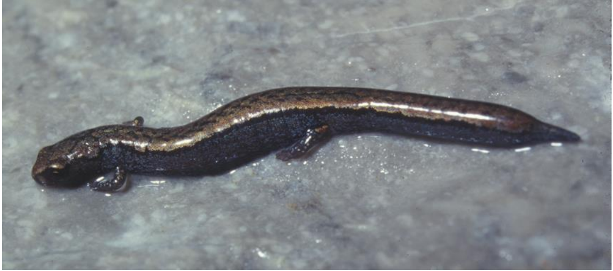
Title: Thorius longicaudus – one of the newly described species of minute salamander Credit: Mario García-París