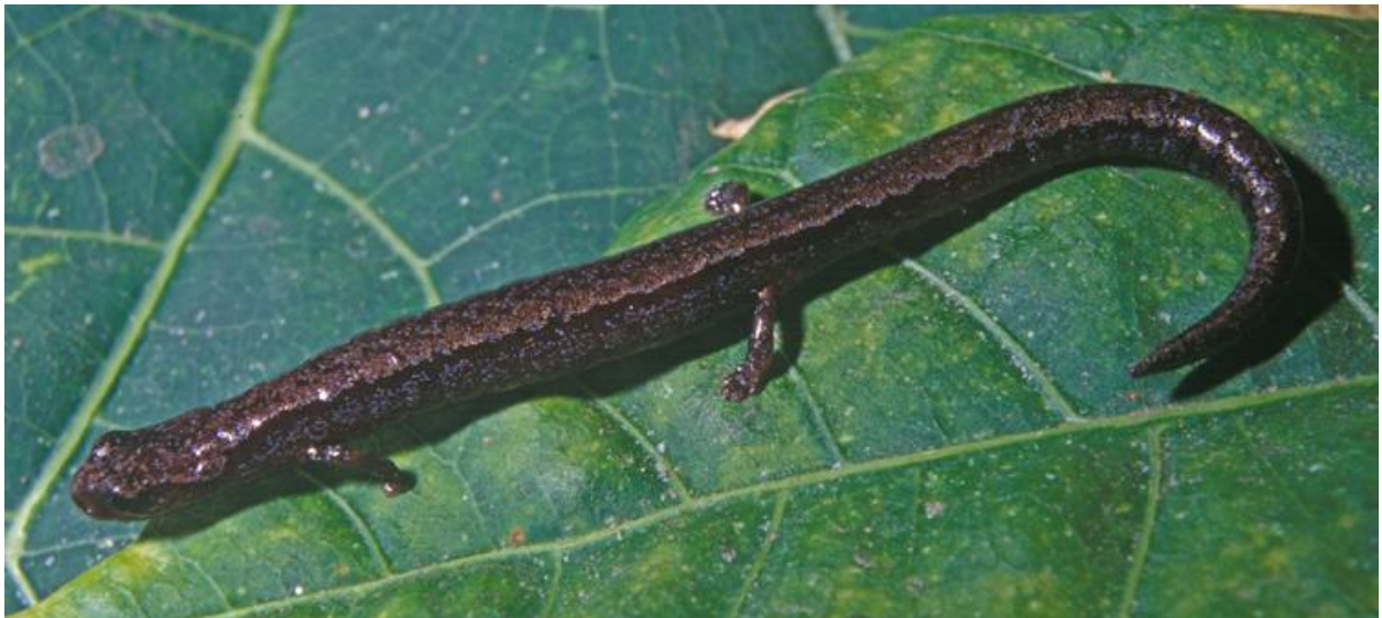
Title: Thorius pinicola – one of the newly described species of minute salamander Credit: Mario García-París